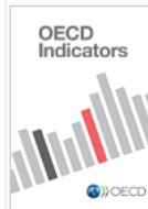
Gross domestic product (GDP)