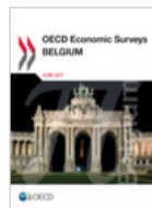
OECD Economic Surveys: Belgium 2017

Slovakia's economy continues to perform extremely well both in terms of macroeconomic outcomes and public finances. Employment is rising, prices have been stable, and the external account is near... more